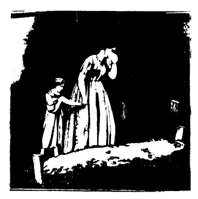
In the eighteenth and nineteenth centuries, artists depicted alcoholism as the "drunkards progress." This example, probably made around 7850, consists of six printed cotton banners.

dependent. It may also be influenced by the same factors, or kinds of factors, that contributed to the substance abuse problem in the first place, including the full range of biological and pharmacological factors, availability and marketing, individual emotional needs, or contextual factors.