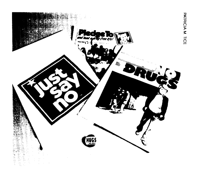
Material from the "Just Say No" campaign.

dren—i.e., those who might otherwise initiate use at earlier ages and then more rapidly progress to abuse and possibly addiction. Early onset of substance use is often more severe than late onset and, as is discussed later in this chapter, early use of substances is one of the better predictors of subsequent problems. Thus, a delay in initial use may offer significant protection even if substances are used later on.