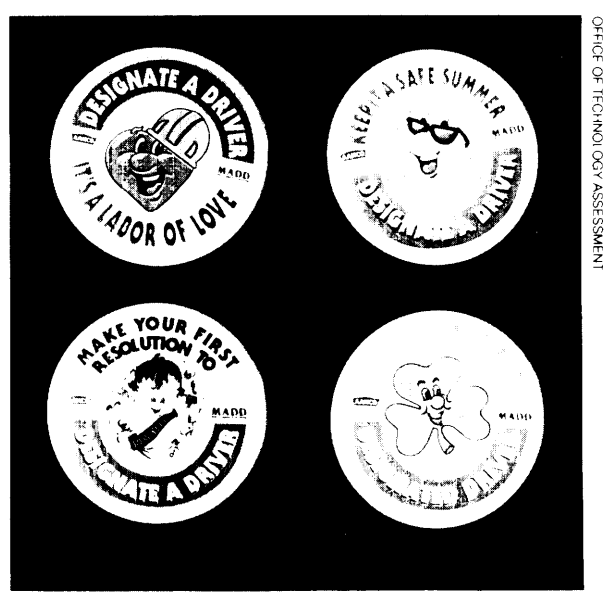
Buttons urging the use of a designated driver, developed by Mothers Against Drunk Driving (MADD) in conjunction with AAMCO Transmissions. The joint campaign targets specific times identified by MADD as especially susceptible to drinking and driving—summer, Labor Day, New Year's Eve, and St. Patrick's Day.

Changes in expectations about the consequences of alcohol use have also been associated with increases in behavioral tolerance. Specifically, less impairment from drinking alcohol occurred when, after the ingestion, successfully performing certain tasks was rewarded, while all